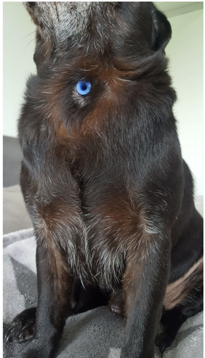
FIGURE 4 Final appearance of Case 1 with the tracheal stent in place.

The dog in Case 2 was released the same day after full recovery from Procedure 2. TS care was well tolerated, and the owner was comfortable with stent removal and reinsertion and did not need assistance by another person. The dog's quality of life had markedly improved, as it was alert and active. The owner on occasion tried removing the stent for longer periods of time but observed the dog intermittently showing signs of dyspnea