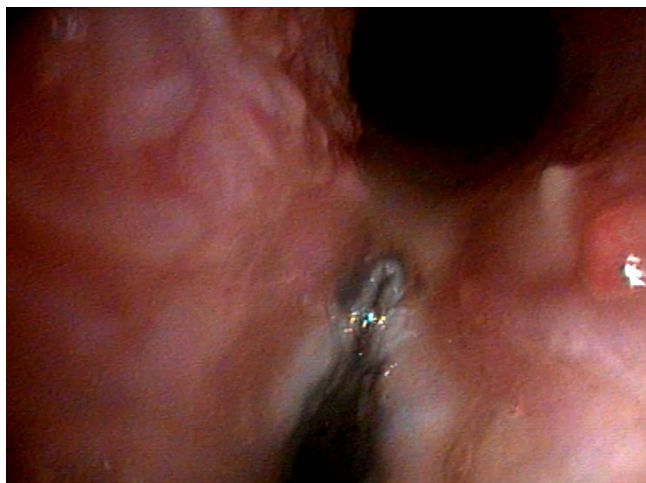
FIGURE 5 Still image of the follow-up tracheoscopy performed 1 year after first stent insertion (Case 1). Note the mild granulation tissue formation in the area of contact with the flanges.

and inspiratory stridor depending on body position. Thus, the owner felt more at ease leaving the TS in situ . It also appeared that the device prevented clogging of the stoma, as mucus did not adhere to the silicone and any debris was easily wiped with a moistened cotton swab.