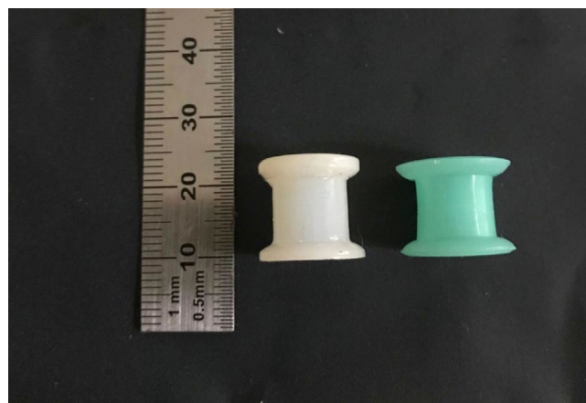
FIGURE 6 Comparative image of the 3D-printed silicone stent on the left and the commercially available stent on the right. Note the 1 mm increased length and rounded flanges of the 3D printed device.

We contacted a manufacturer specialized in 3D printed silicone products (Spectroplast, Zurich, Switzerland), who printed customized medical-grade silicone TS with lengths of 11 and 12 mm and rounded flanges to reduce irritation (Figure 6). The skin lesions healed with the 11 mm device in place. However, the material (Truesil A50) was slightly stiffer and thus more difficult to fold for insertion. After approximately 6 weeks of usage (six times removal, cleaning, and reinsertion), the 3D-printed TS developed a crack when the owner removed it. The owner therefore did not use the 3D printed stents for longer than 3–4 weeks before discarding them. Like with the commercial TS, the dog showed no signs of discomfort when wearing the 3D-printed specimen. However, unlike Case 1, in which the dog played enthusiastically, the stent occasionally fell out. During a follow-up examination, it was found that the stoma