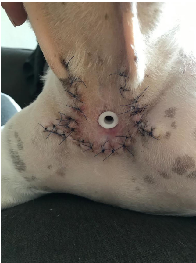
FIGURE 3 Appearance of Case 2 2 weeks after removal of surplus skin and insertion of the stent. Note the device's flanges, which have been cut by the owner to alleviate skin sores.

A follow-up tracheoscopy was conducted 1 year after first insertion of the TS to check for secondary changes to the tracheal mucosa, such as granulation tissue formation or pressure necrosis. The TS was removed for the procedure. Endoscopic examination of the tracheal stoma under general anesthesia revealed that the tracheostomy had healed satisfactorily, with minor signs of granulation tissue in areas in direct contact with the flares of the TS (Figure 5).